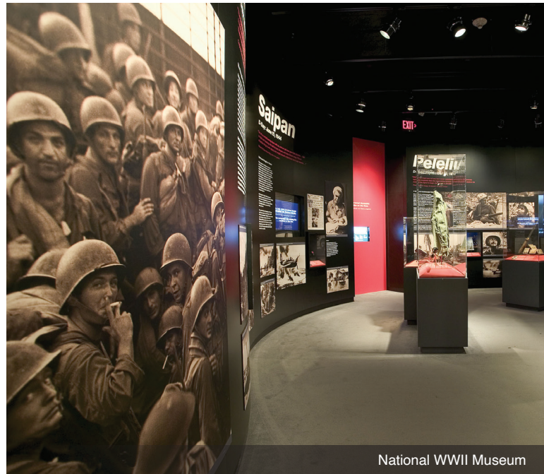
National WWII Museum

DAY 1 Arrive in New Orleans: Welcome to New Orleans, Louisiana, America's jazz capital. Meet your Tour Manager in the hotel Lobby at 6:00 p.m. for a transfer to our welcome dinner and cooking demonstration at the New Orleans School of Cooking. Located in a renovated molasses warehouse in the heart of the French Quarter, you will learn the basics of Louisiana cooking from well-known local chefs. Creole/Cajun experts teach New Orleans specialties such as Gumbo, Jambalaya and Pralines, and season them with history, trivia and tall tales. You'll be treated to a wide range of local classics and get to enjoy them in sumptuous feast. It's a "ga-ron-tee'd" good time for all. After dinner, feel free to enjoy the French Quarter on your own. Meal: D