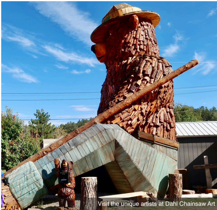
Visit the unique artists at Dahl Chainsaw Art

an on own lunch. Then, a local guide takes you through Badlands National Park, a uniquely beautiful geologic area formed over millions of years by wind, rain and erosion. Return to Rapid City for a farewell dinner featuring the entertainment of an Indian dancer, storyteller and flute player. Meals: B, D