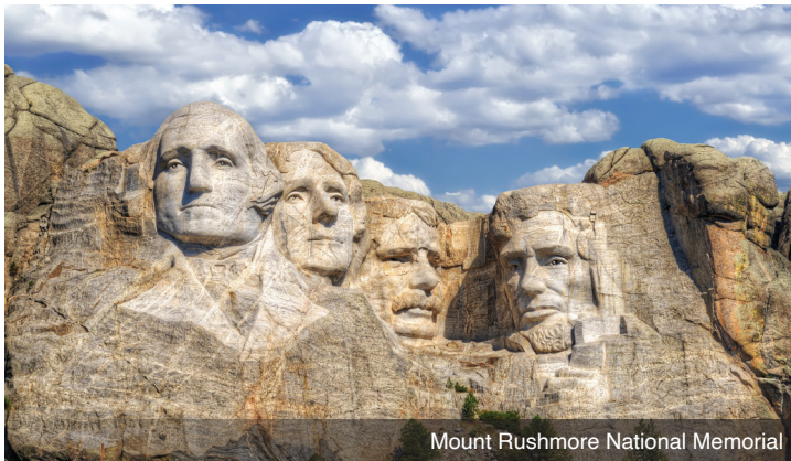
Mount Rushmore National Memorial

DAY 6 Travel Home: After breakfast, a group transfer to the Rapid City airport is available for flights out after 10:00 a.m. Meal: B