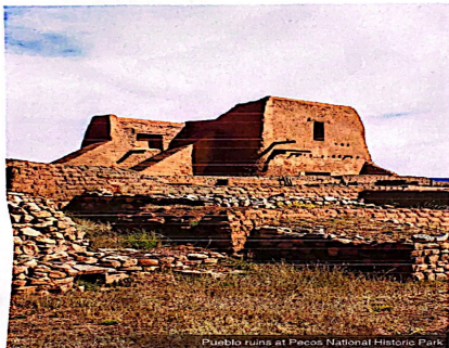
Pueblo ruins at Pecos National Historic Park

DAY 5 Pecos National Historic Park: Travel east of Santa Fe to visit Pecos National Historic Park, which features the ruins of Pecos Pueblo and Mission. Pecos is the site of the westernmost battle of the Civil War, the Battle of Glorieta Pass that was fought March 26-28, 1862. Tonight, enjoy dinner hosted by your Tour Manager. Meals: B, D